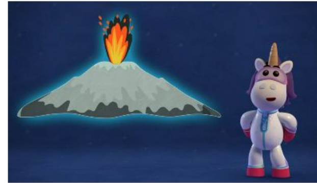
Mount Etna, Italy