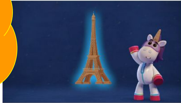
Eiffel Tower, France