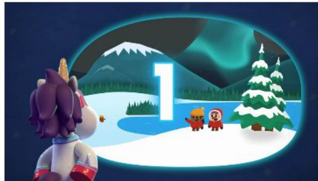
Northern Lights, Finland