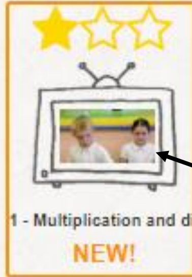
1 - Multiplication and div