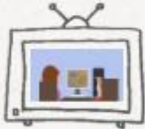
Maths with Parents Intrc