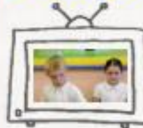
1 - Multiplication and div